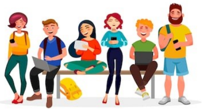
Young People Group

Our lady of Victories - Ballymun Road Entrance from the back of the church #18-35 # faith # sharing # chat # friends # life # bigquestions Info: ourladyofvictories.young@gmail.com