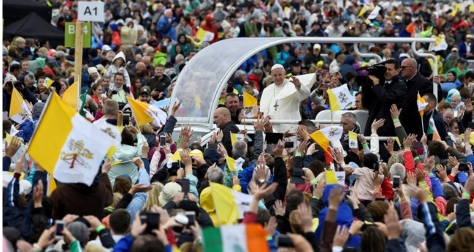
Pope Francis in Dublin

Issue No 25/28 Parish of St. Columba 2 September 2018