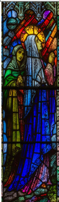
Detail from one of the Stained Glass windows in our church.

We thank parishioners for your contributions to the First and Second Collections and to the Family Offering. Contributions can also be made through the 'Donate' button on the parish website: www.ionaroadparish.ie