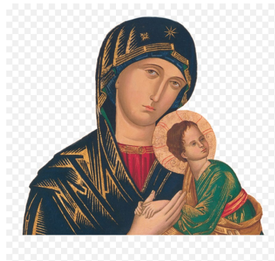
Mother of Perpetual Help Pray for Us.